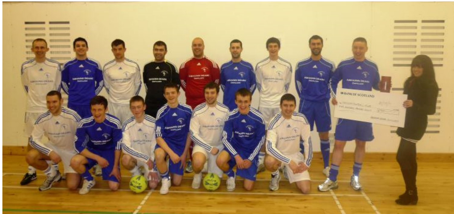
The team modelling the new home and away kits